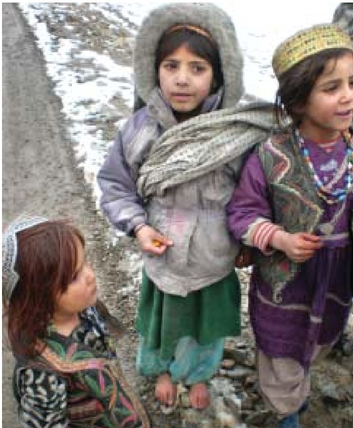
The faces of the future of Afghanistan; note the snow on the ground and the center child without shoes.

Whenever team members started feeling down, all we had to do was look at the plight of the villagers we were there to help. For instance, our not being able to shower for a few months because the pipes were frozen paled in comparison to the baby who died from lack of fresh drinking water. Although we struggled with communication because of satellite issues, the local people suffered when terrorist groups shut down cell towers and made it impossible for them to call for a doctor.