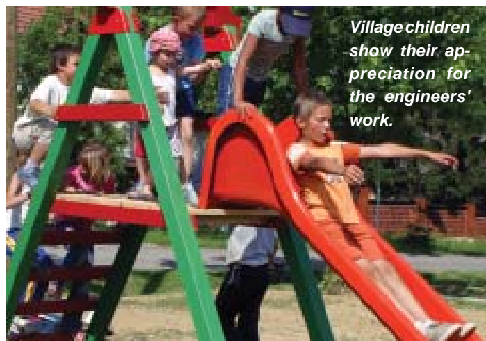
Village children show their appreciation for the engineers' work.

As the engineers left the small village, their solutions gave the community a few improvements and gave everyone insights into their different worlds. 🇺🇸