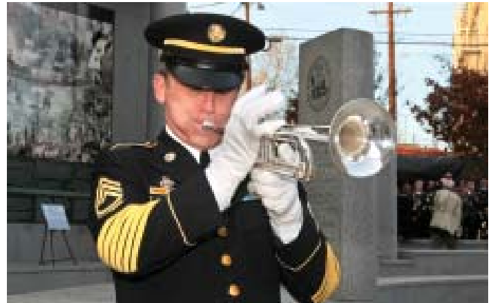
Bottom page: The 177th Fighter Wing performs the traditional Missing Man Formation at the close of the ceremony.