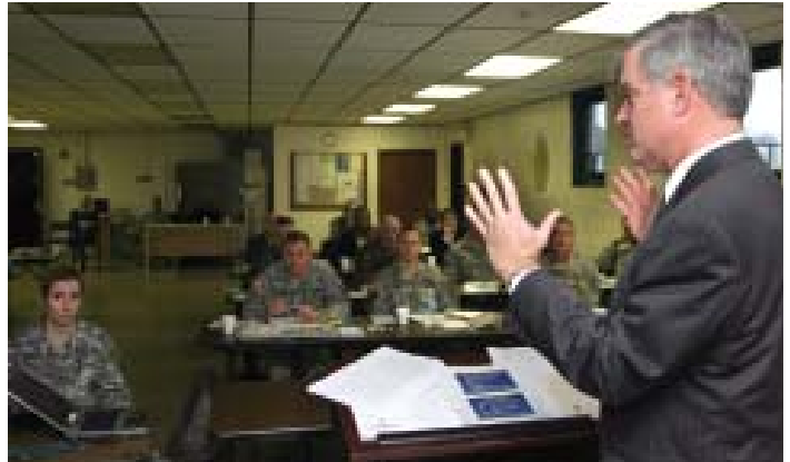
Judge Louis Belasco, presiding Atlantic County municipal court judge, discusses the criminal justice system with Veterans Assistance Project mentors. The fledgling program will allow New Jersey National Guard Airmen and Soldiers to mentor veterans who have run into legal trouble.

They got a crash course on New Jersey's criminal justice