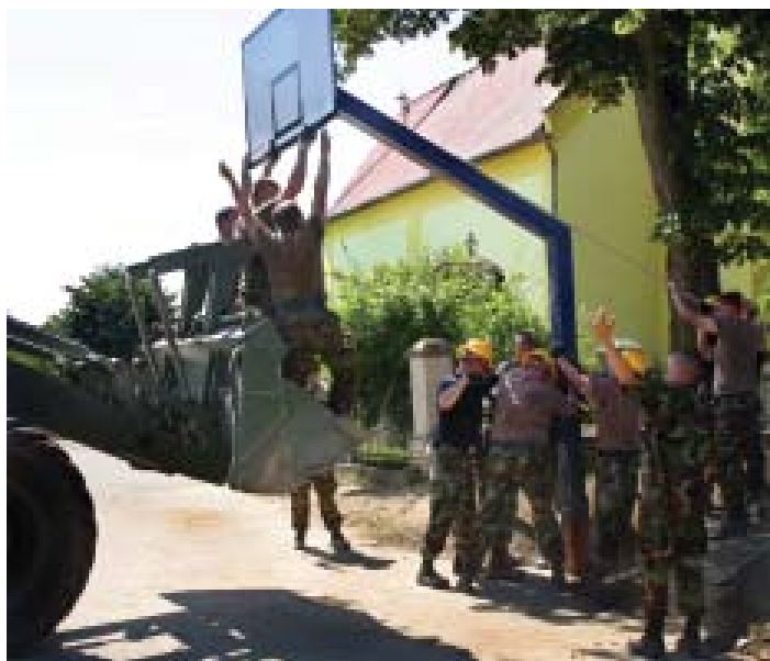
Above: "Croatian ingenuity" comes into play: a Croatian engineer raises three of his soldier in a bucket loader while the soldiers and Airmen on the ground situate the basketball standard.

Photos and story by Staff Sgt. Barbara Harbison, 108ARW/PA