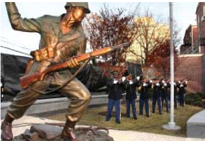
Below: New Jersey Army National Guard Soldiers prepare to render a rifle salute.